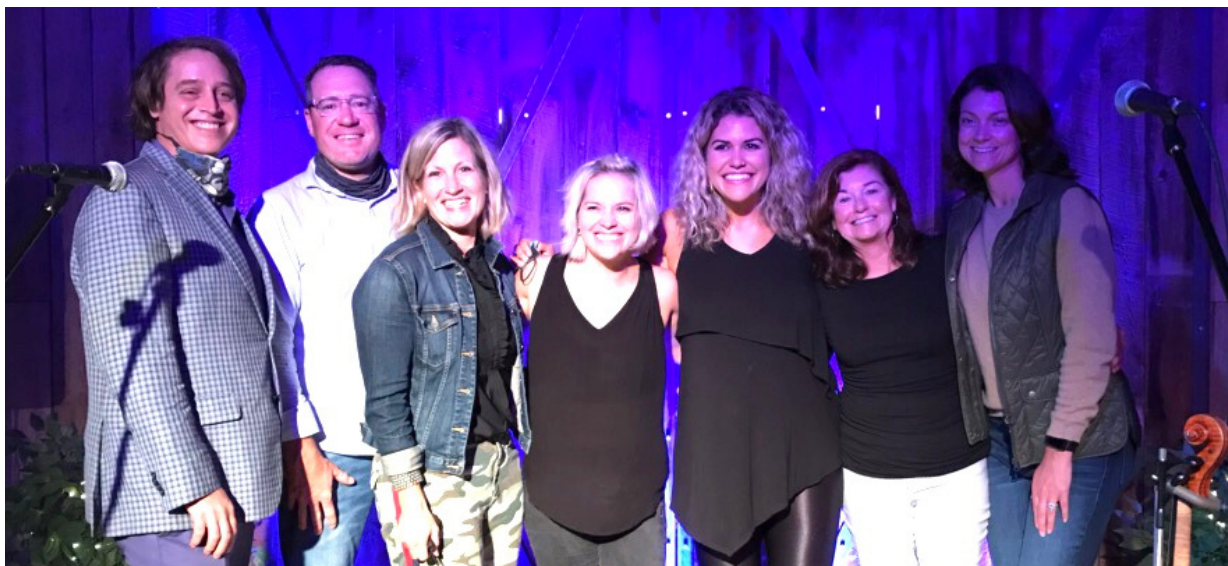
Play it Forward 2020 with the Moxie Strings